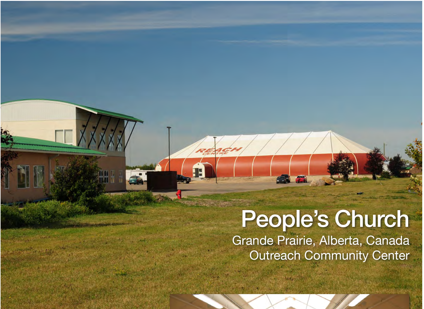
People's Church Grande Prairie, Alberta, Canada Outreach Community Center

Engineered & Manufactured by Sprung Instant Structures