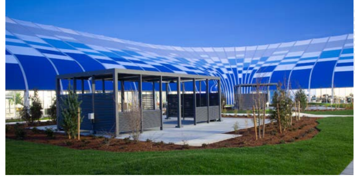
Sheltered within the facility's U-shape, this outdoor garden provides a tranquil area for employees.