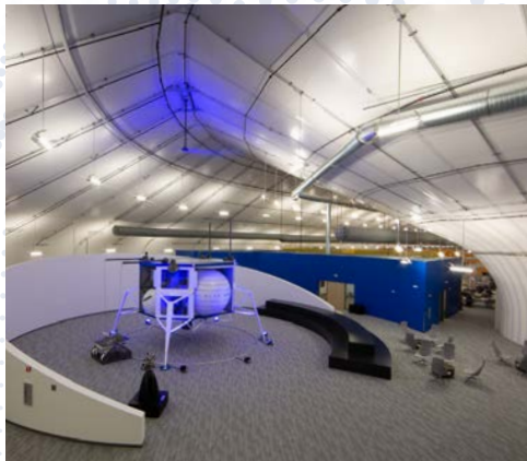
A full-scale replica of Blue Origin's lunar lander sets the tone for employees and visitors in the HQ's main entrance.